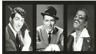
Rat Pack Flashback™ The Music of Dino, Frank, & Sammy

WEDNESDAY, JUNE 21, 5:30 PM* - 9:00 PM Registration required by June 11